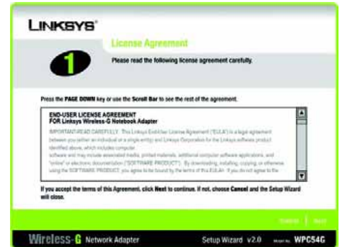
Figure 4-2: The Setup Wizard's License Agreement